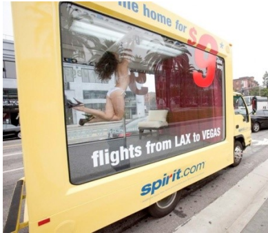
Exhibit 1. Example of Spirit Airlines' Ad Presentation.

“Spirit Strippermobile Brings Airlines Notoriously Risqué Marketing to the Offline World”. (2011). NYC Aviation . Retrieved on November 5, 2017 from http://www.nycaviation.com/2011/06/spirit-airlines-stripper-mobile-brings-their-notoriously-risque-marketing-to-the-offline-world/16004 .