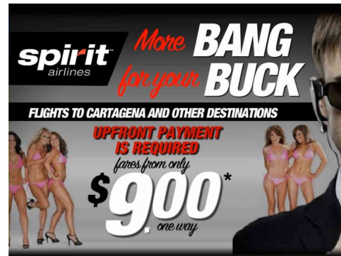
Exhibit 4. Spirit's CIA Agent Sex Scandal Ads.

“Spirit Airlines Ad Uses Secret Service Prostitution Scandal To Sell Flights To Colombia”. (2012). Huffington Post . Retrieved on November 5, 2017 from https://www.huffingtonpost.com/2012/04/19/spirit-airlines-uses-secret-service-prostitution-scandal-to-sell-flights_n_1437748.html .