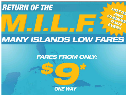
Exhibit 5. Spirit’s Many Islands Low Fair Ad.