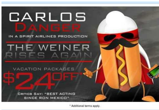
Exhibit 6. Carlos Danger Ad.