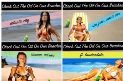
Exhibit 2. Response to BP oil spill in the Gulf of Mexico.

Klint, M. (2010). Spirit Airlines' New Ad Campaign: “Check out the Oil on our Beaches”. Live and Let's Fly . Retrieved on November 5, 2017 from http://liveandletsfly.boardingarea.com/2010/06/24/spirit-airlines-innocent-new-ad-campaign-check-out-the-oil-on-our-beaches/ .