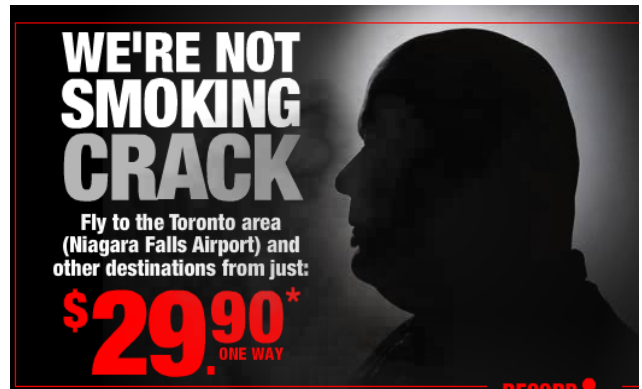
Exhibit 7. Spirit’s Toronto Mayor’s Drug Use Ad.

Weissman, S. (2013). Spirit Airlines: ‘We’re not Smoking Crack’. Digiday . Retrieved on November 5, 2017 from https://digiday.com/marketing/spirit-airlines-crack-discount/ .